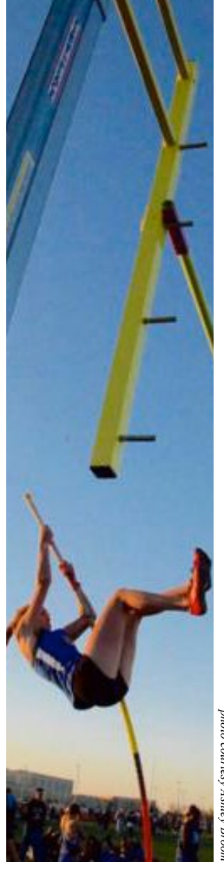
ourtesy Ashley Bro